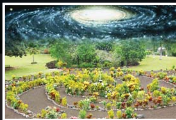
Galaxy Garden Hawai'i