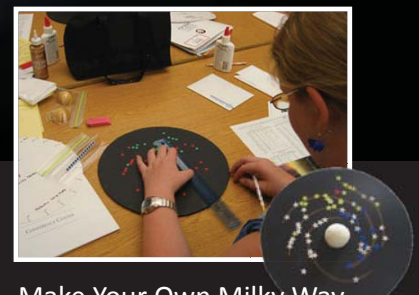
Make Your Own Milky Way Model - Subaru Telescope