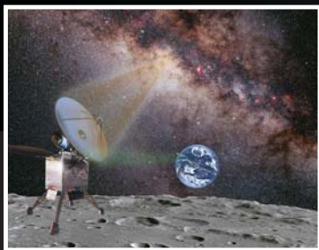
ILO First Light Galaxy Imaging